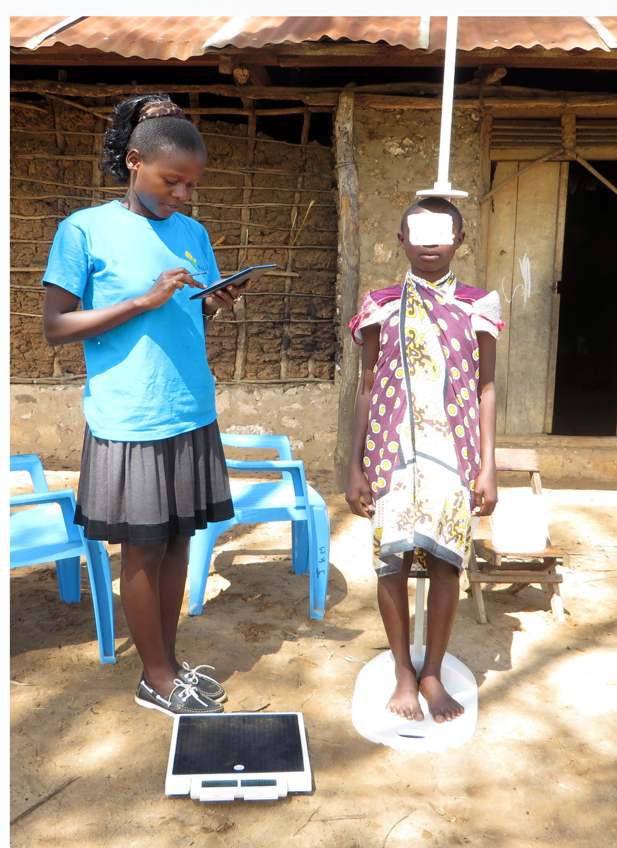
Figure 2. Anthropometric measurements of children and caregivers

To investigate the potential of baobab in food security among households residing along the baobab belt in Kilifi and Kitui counties.