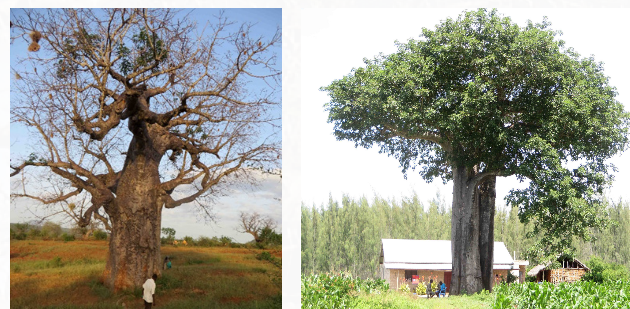
Figure 1. The baobab tree

» A cross-sectional study design was applied in Kitui and Kilifi counties of Kenya. A sample of 216 caregiver/child pair was interviewed between July and November 2017. Information on food security status, malnutrition and utilization of baobab was obtained.