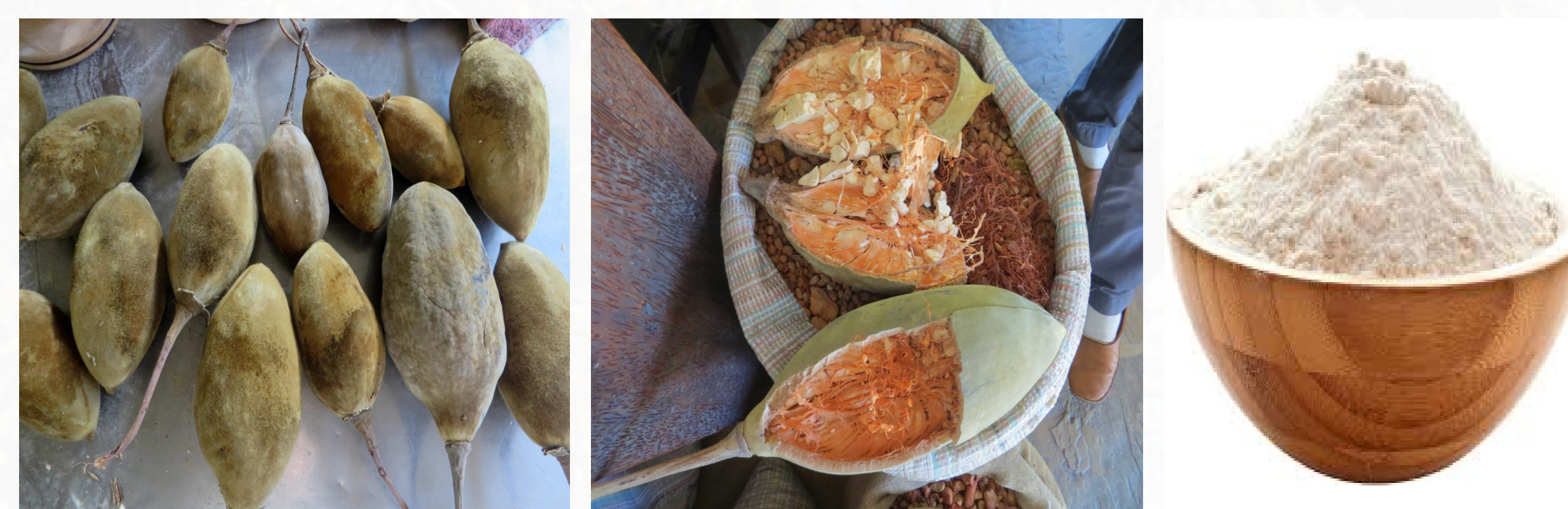
Figure 3. Whole and cracked baobab fruit